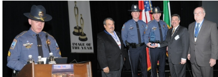
NAUMD Acceptance Speech March 6, 2010

225 Main Street • Old Saybrook, Connecticut 06475